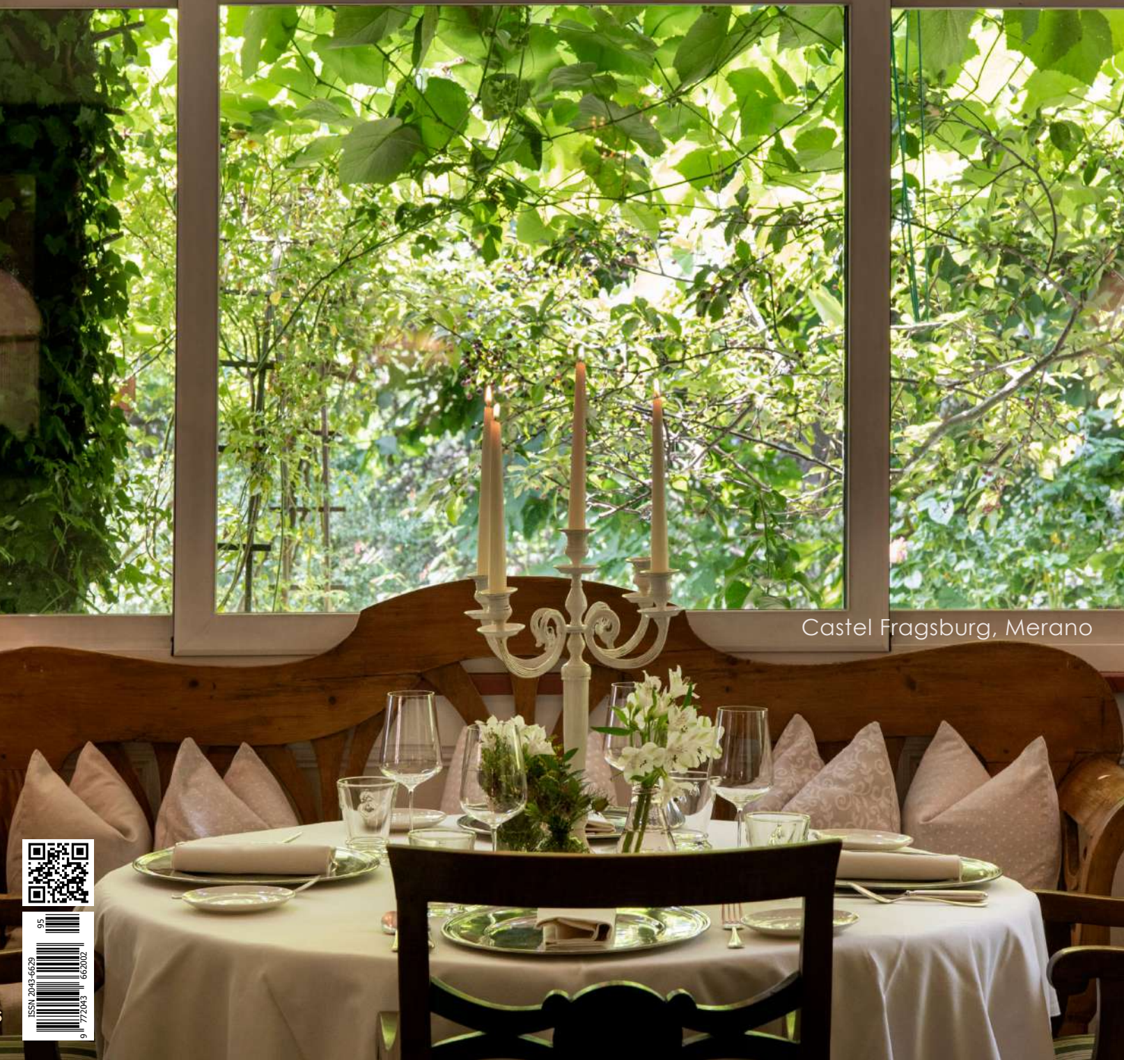
Castel Fragsburg, Merano